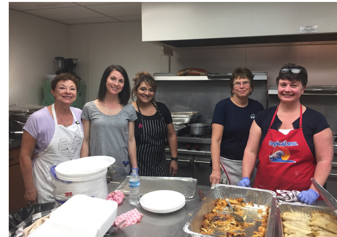
A multitude of volunteers helped prep food in the kitchen