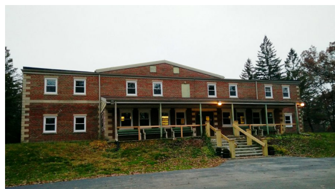
A photo of the Baraga St. Mary Retreat House