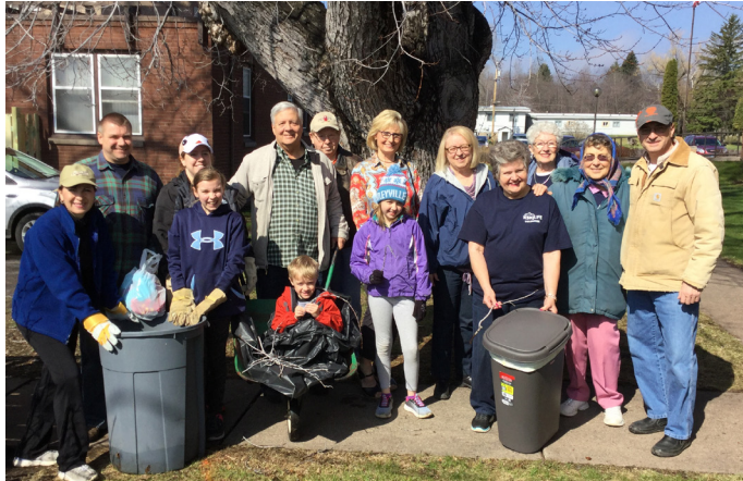
Members clean the grounds around St. Elizabeth's Church and Stowe School Elementary for Join Hands day.

We'll be celebrating KSKJ Life's 125th year anniversary on Thursday, June 27th with a Bean Bag Tournament & Picnic. RSVP by June 24th to bucarf@gmail.com . Hope to see a great turnout for this event!