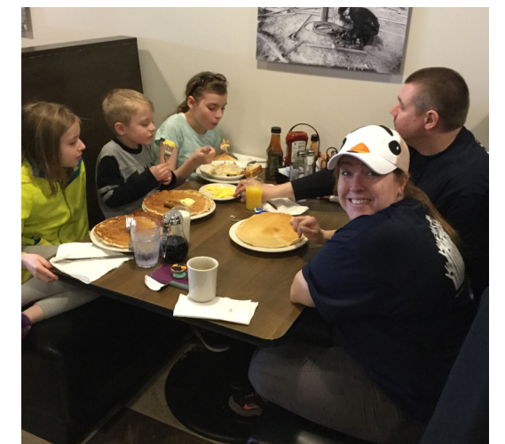
Members enjoy a hearty breakfast after the Join Hands Day Cleanup.