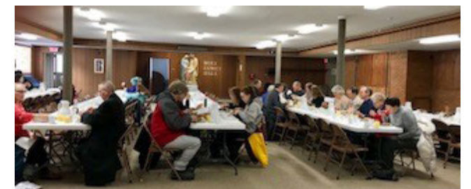
A full house at the pancake breakfast.