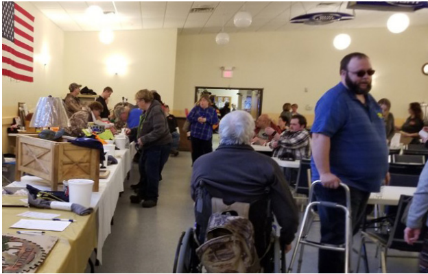
Customers Checking out Raffle area

We will be having our 2nd Matching Funds in June with the Willard Historical Society. Look for the information in the May issue.