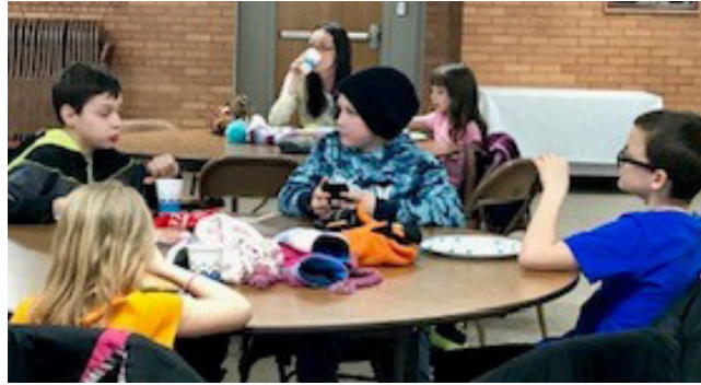
Children in religious education classes having a good time on full stomachs

As long as we had the griddles, the Knights of Columbus and KSKJ Lodge #59 cooked hamburgers with all the trimmings and desserts for the religious education classes the following Wednesday, February 27.