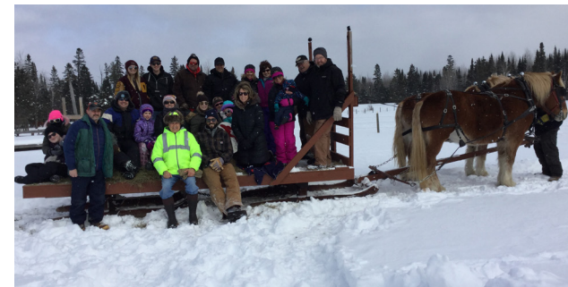
The Sleigh is ready for departure on a beautiful