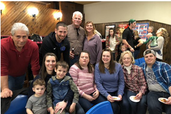
KSKJ Life members, and friends of WSRA having a "ball" at the St. Mary #79 Bowling fundraiser.