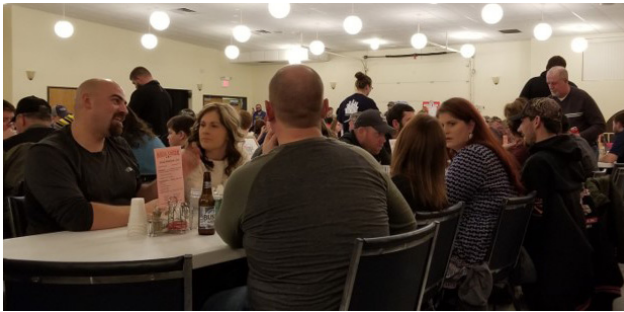
The Legion Hall was packed!