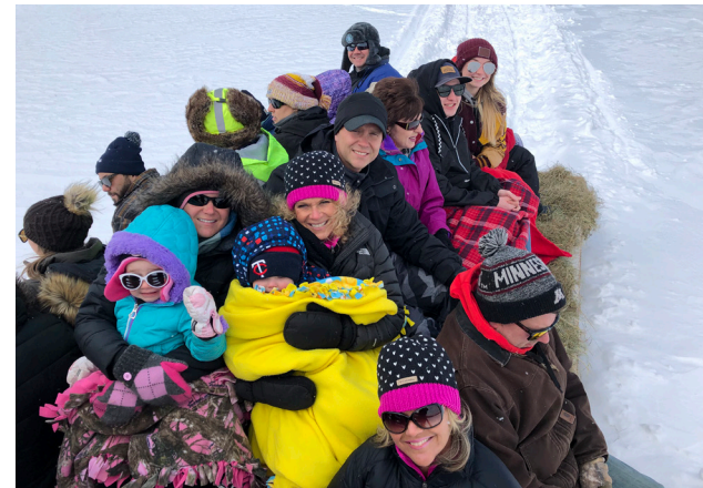
All bundled up and enjoying the Sleigh Ride!

St. Elizabeth Lodge #171 held their Annual Sleigh Ride on Sunday, February 17th, at Countryside Rides near Duluth, MN. Everyone had a great time - luckily we were able to "slide" the sleigh ride in between the frigid Arctic below zero temperatures and the every other day "blizzards"!!!