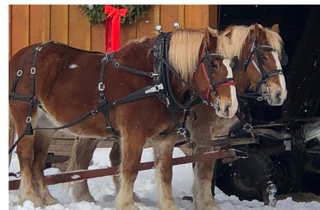
The horses anxiously await the arrival of the KSKJ'ers