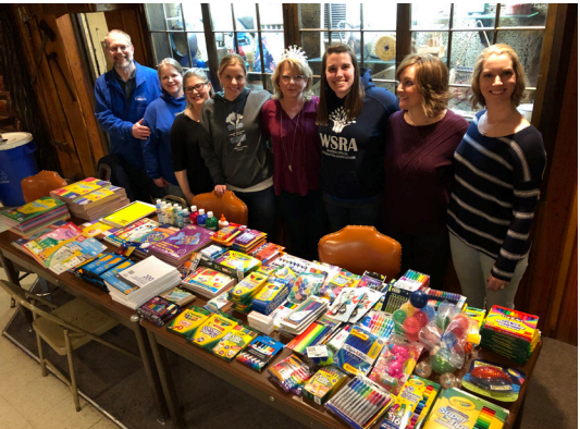
School Supplies to benefit the summer programs sponsored by WSRA were collected at the annual Matching Funds event.