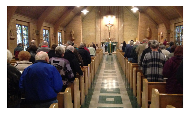
The congregation was assembled for this special "Tamburica Mass" which was held for the first time in this entire area.

to benefit St. Elizabeth's Catholic Church in Duluth. The food was delicious, and the Singing Slovenes delighted the crowd. Proceeds raised from the event will help to replace the boiler room at St. Elizabeth's Church.