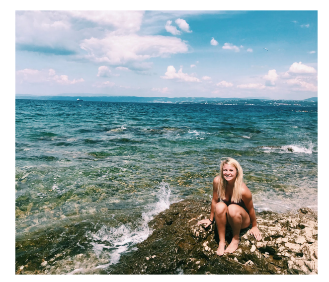
Beach days are the best days! The bodies of water in Slovenia were incredibly clear and blue.

"The charm of Slovenia and the people in it are things I will always look back fondly on," Lacey reminisced. "If I ever found out that I only had one more day to live, I would want to go back and spend it there."