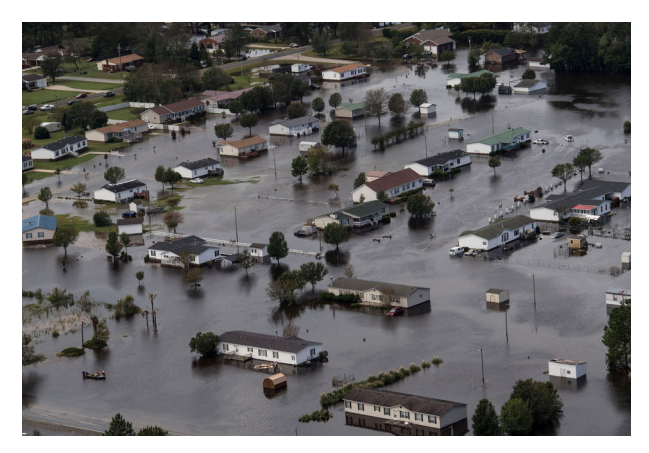
Flooding from Hurricane Florence as seen in Lumberton, North Carolina.

Thank you for your generosity. KSKJ Life Foundation