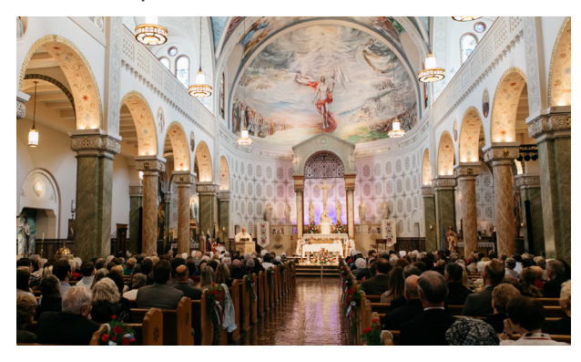
An inside view of St. Vitus Church.

Neuzil was called forward to offer an opening prayer for the banquet.