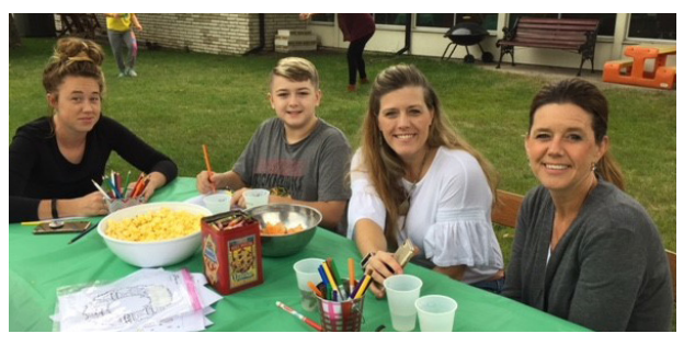
Members enjoyed coloring Christmas pictures for residents of Our Lady of Angels Nursing Home in Joliet. The pictures will be distributed in December during our holiday caroling event there.

Some of our younger guests (along with a few "kids at heart") channeled their inner Picassos and colored some Christmas coloring pages that will be distributed to residents of Our Lady of Angels Nursing Home in Joliet when our lodge goes caroling there in December. More information about this caroling event will be forthcoming.