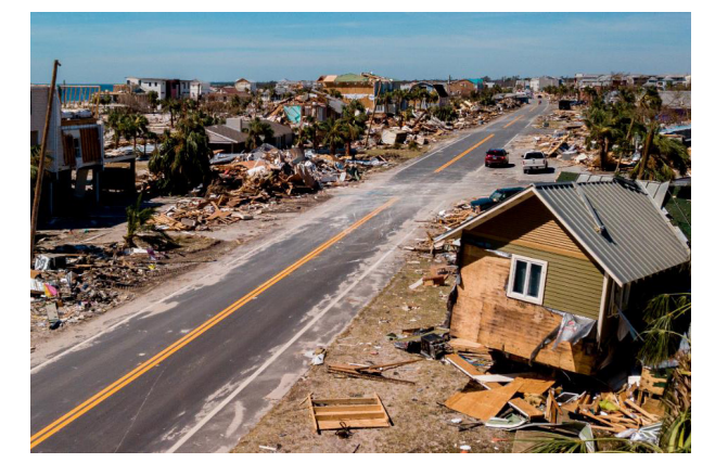
Mexico Beach, FL after Hurricane Michael