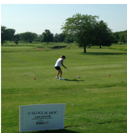
Hole sponsor signs could be seen throughout the golf course thanks to our generous hole sponsors. This initiative alone brought in $1,750 for the Scholarship Fund.