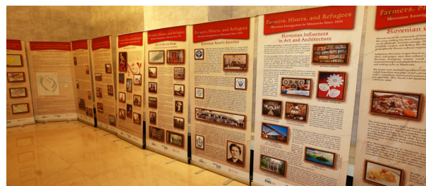
A historical collection of Slovenian culture was displayed during the convention.

When meetings were not in session, delegates and guests had a nice selection of items of interest to view. Pictures that captured yesterday have a specific way of enhancing an event when members and history are featured.