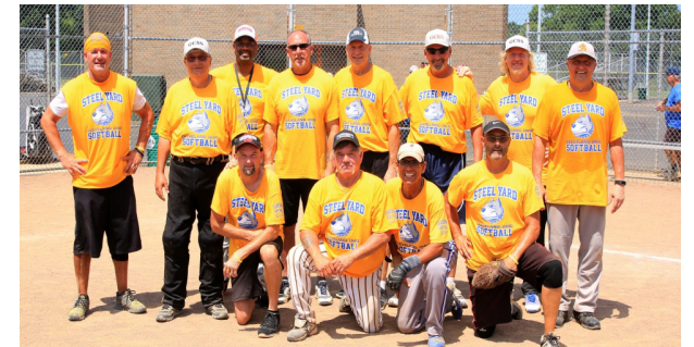
Porky Pig Softball Runner Ups: Greater Cleveland Senior Softball All-Stars (Team Steel Yard)