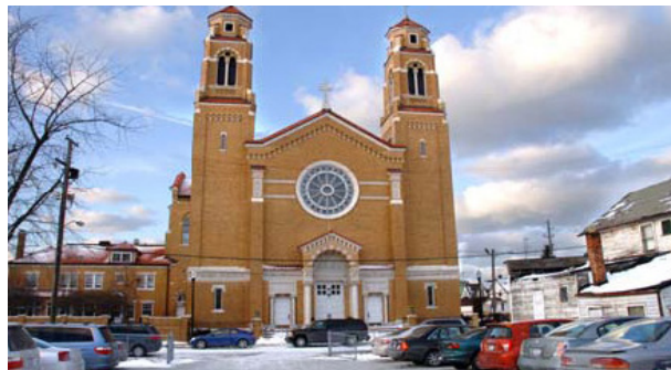
St. Vitus Parish