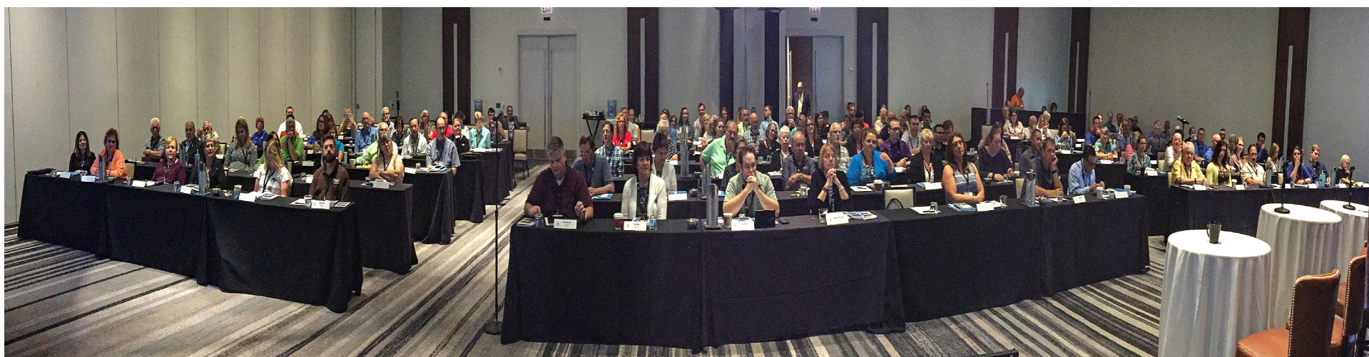
A panoramic view of the 2018 KSKJ Life National Convention opening session

We thank you all for your time, commitment, and dedicated service to KSKJ Life throughout the years.