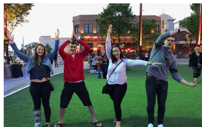
It's fun to stay at the YALC