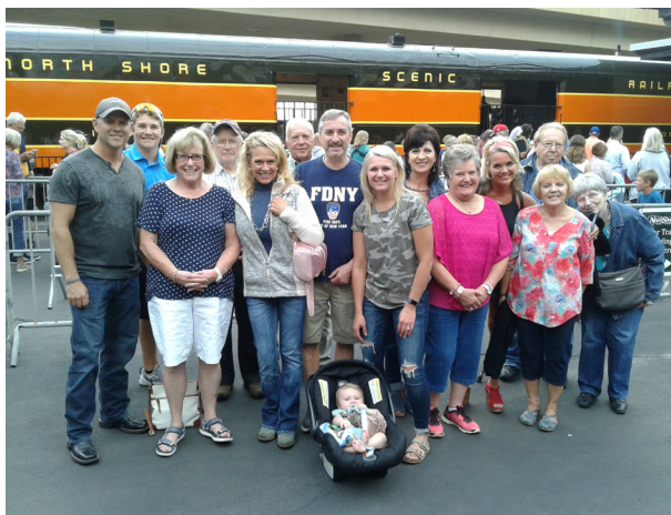
All Aboard!" the Conductor shouts as the KSKJers await boarding of the Pizza Train at the Depot in Duluth, MN.

Is there anything more enjoyable than pizza on a train? St. Elizabeth Lodge #171 had a terrific time during their recent Pizza Train Activity in Duluth, MN.