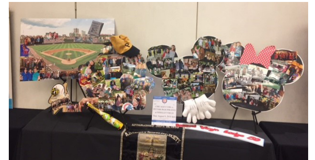
Blessed Virgin Lodge #50's impressive History Room display.

In one of the convention ballrooms, there was a History Room where lodges brought their pictures and stories for display to share with others. Equally as exciting were the four videos unveiled for the first time at the convention that feature pictures depicting Fraternal events all around KSKJ. The video titles are: Family and Fun, History and Spirituality, Participation and Commitment, and Charity. Soon they will be available on our KSKJ Life website. We were also fortunate to have the very impressive display from St. Cloud: "Farmers, Miners and Refugees: Slovenian Immigration in Minnesota since 1855."