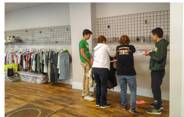
Volunteers help set up the clothing distribution ministry

Prior to the Solemn Mass, Bishop Perez will bless and dedicate the newly remodeled Joseph House of Cleveland Inc., at 6108 St. Clair Avenue, Cleveland, Ohio 44103. Blessing and dedication will occur at 9:30 am. Joseph House is 100 feet from St. Vitus Church.