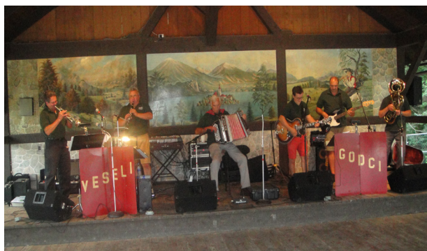
The Veseli Godci provided the polkas and waltzes at Lodge 169's Matching Funds picnic with MZA – Catholic Mission Aid annual picnic.

August 9-11, our delegates attended the KSKJ Life National Convention in Chicago. You can read about the highlights in this and the next issue of the Voice.