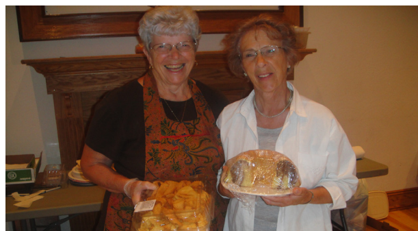
Donated bakery was a hit at the MZA picnic in Harpersfield, Ohio.