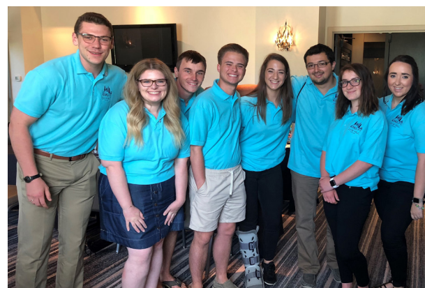
Young adults rock their blue KSKJ shirts on the last day of YALC