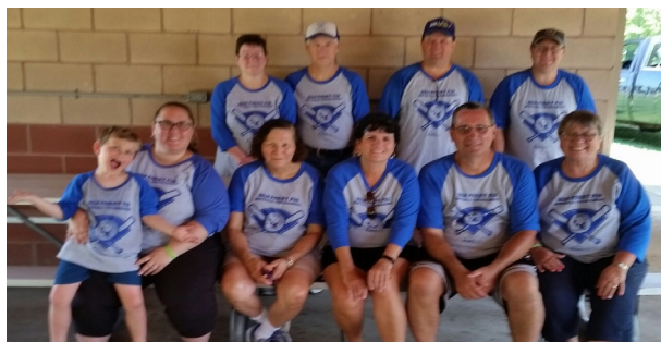
Porky Pig Lodge #150 Members