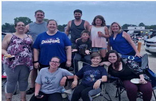
We had a great group for our Night at the Drive-In. Luckily we were able to get this photo before the sunset!