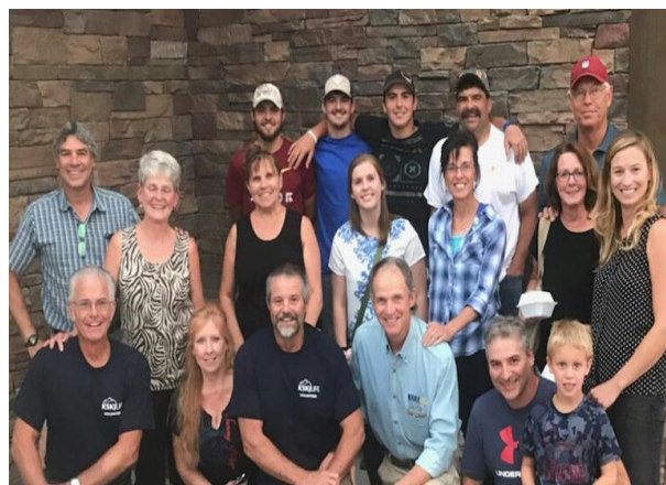
St. Joseph Lodge #69 celebrating their 115th anniversary in Great Falls, MT.