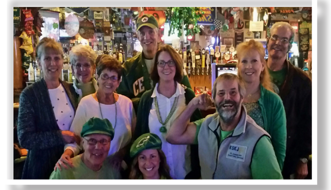
St. Joseph Lodge #69 from Great Falls, MT during their St. Patrick's Day Lodge meeting in 2018

Congratulations to Lodge #69! Here's to many more terrific years to come!