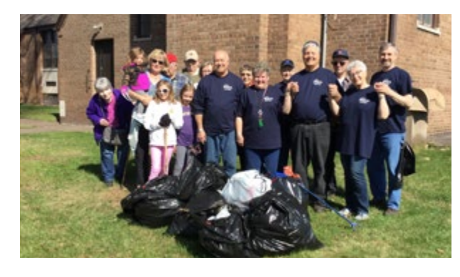
A team effort for Join Hands Day