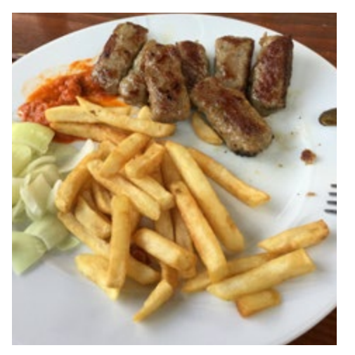
Plate of traditional Čevapčiči from an outdoor restaurant in Slovenia.