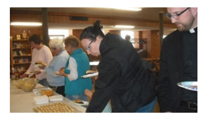
Guests fill their plates with some delicious homemade sweets as well as the perfectly-cooked burgers.

On May 5th, our lodge helped with the Cinco de Mayo celebration/fundraiser for Marquette School at Holy Spirit Church in Virginia. Earlier that same day we helped the Eveleth Fire Department with a BBQ sale during the Eveleth City Wide Rummage Sales.