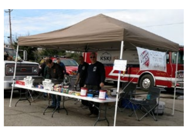
The Fire Department crew with member of KSKJ Life ready to open the BBQ tent