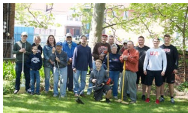
A picture from last year's Join Hands Day

Lodge #226 will once again be working at the American Slovenian Home on St. Clair Ave. for KSKJ Life's Join Hands Day. We will gather on Saturday, May 5 at 10 a.m. and will work until noon. Bring your garden gloves and wear old clothes as we will be weeding and planting, cleaning and painting. If you are in a lodge that does not have plans for that day, consider coming out to join hands with us.