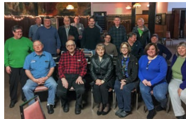
Ohio Federation officers and lodge members gathered at the Ohio Federation meeting on Sunday, April 15, 2018