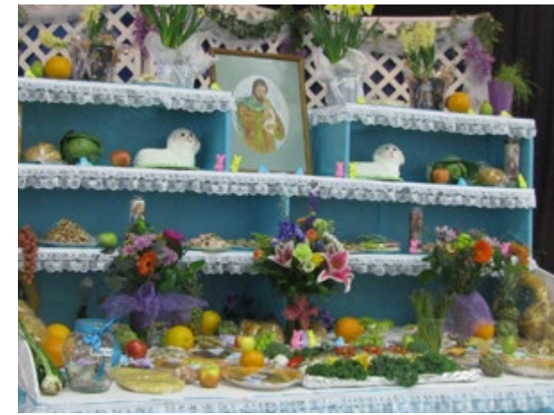
A photo of the decorated St. Joseph's Table featuring various food and flower arrangements.