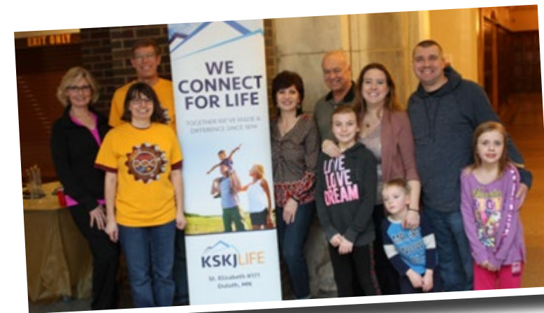
KSKJ Members gather around the KSKJ Connect for Life Banner for the Matching Funds Project.

St. Elizabeth Lodge #171 recently held a Matching Funds event in conjunction with the Denfeld High School Robotics Team dinner and fundraiser. Funds raised at the event will be used to pay for tournament fees, robot materials and other team expenses. It was a festive event which consisted of a taco bar menu and various silent auction items. Net proceeds from the event totaled more than $5,000 (not including the Matching Funds amount from KSKJ Life's Home Office).