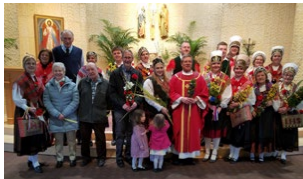
Members of Lodge #65 recently took part in the traditional Palm Sunday Mass at St. John the Evangelist parish in Greenfield, WI.

Many of our members participated in the Palm Sunday procession and mass at St. John the Evangelist Church. They carried butare, some wearing Slovenian Dress or sporting red carnations as the Slovenian Choir sang the beautiful hymns of that day.