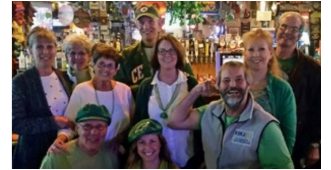
Lodge #69 officers and members all decked out in green for St. Patrick's Day

St. Joseph Lodge #69 in Belt, MT held its first quarterly meeting at Belt Brew Pub on St. Patrick's Day March 17. During the meeting we planned projects and dates for Join Hands Day projects, plus scheduled a date and location for the second quarterly meeting. After the meeting, the Lodge members attended 5 p.m. mass before returning to the pub to eat & celebrate St. Patrick's Day. See photo in the next column.