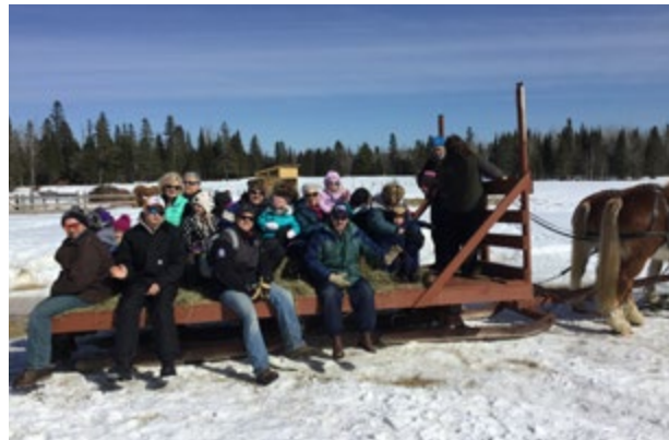
Members and guests enjoy a wonderful sleigh ride on a beautiful sunny day.