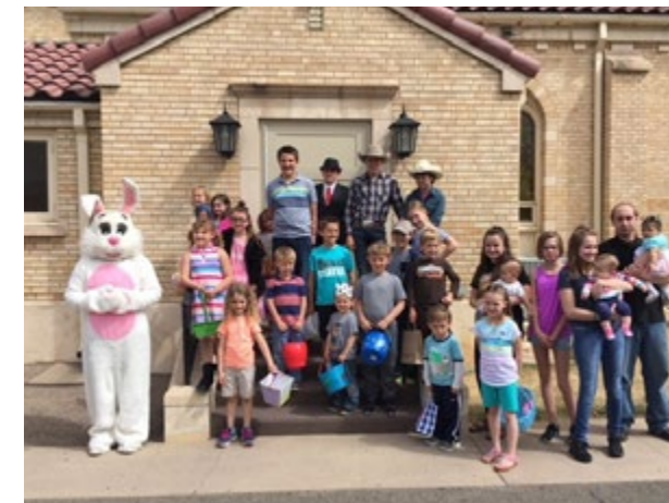
A group picture of the children and the Easter Bunny at the Easter Egg Hunt on May 25th

We would like to thank all those who were involved in the preparation/set-up for the Palm Sunday Breakfast and the Easter Egg Hunt.