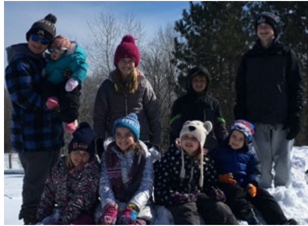
Youth Members enjoying the final days of winter during our annual sleigh ride.