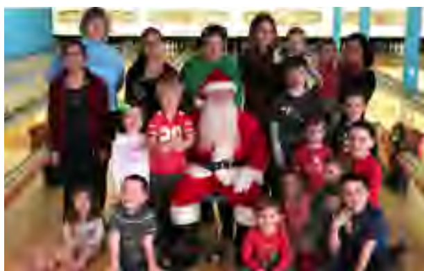
Santa with the children from lodges #63, #146 and #150

Lodges #63, #146 and #150 joined together for their annual Christmas Party on December 3. A great time was had by all and a special guest visited with the children....Santa Claus!