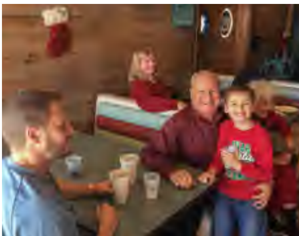
Joliet members are all smiles at the Christmas Party.

With no other news to report about, the next meeting of the combined Joliet Lodges will not be held until February 6, 2018. More information will be available in the next issue of The Voice .