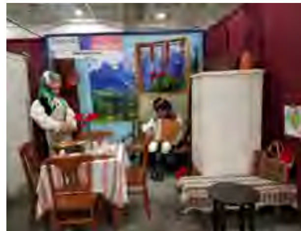
The Slovenian Scene at the Holiday Folk Fair.

The Holiday Folk Fair was held in Milwaukee on November 17, 18 and 19, and the Slovenians were well-represented. This year the cultural display was co-sponsored by the Triglav Cultural Society, USPEH, and the Slovenian Arts Program. The theme was "Welcome." The Slovenian scene was a kitchen displaying Slovenian Foods, a musician and Mt. Triglav pictured through the window. The exhibit took first place in the Artistic Presentation. Many thanks to all the people who helped make our Slovenian Community proud.