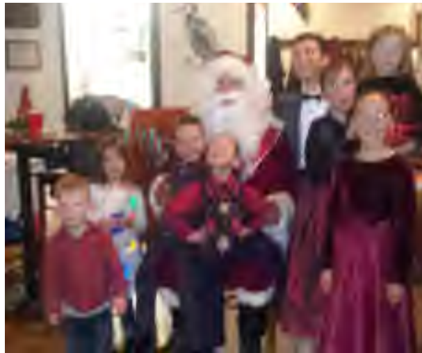
Santa Claus made a visit to the delight of all the children who attended.