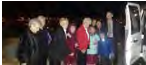
Transportation to and from the party was provided for our guests who no longer drive.