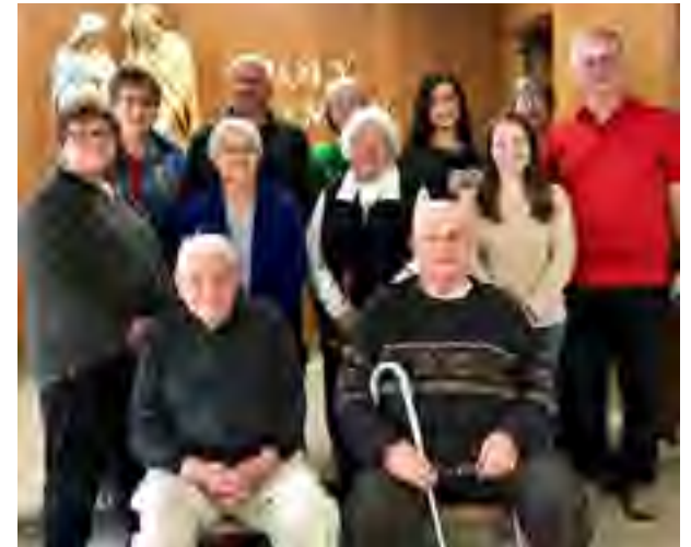
2018 Lodge #59 Officers