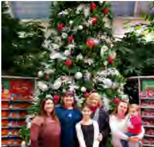
Members of Lodge #42 choose the perfect spot for a holiday photo