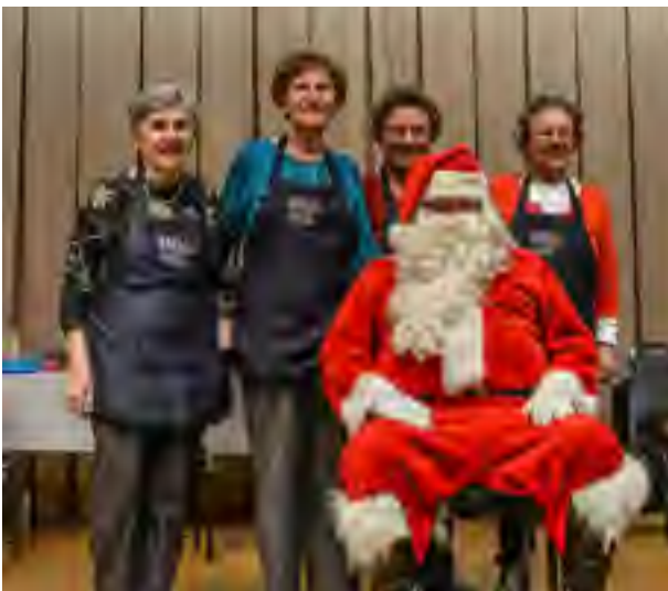
Santa with the kitchen crew.