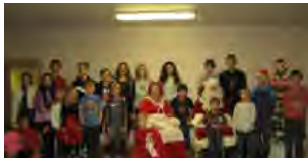
Santa and Mrs. Claus stopped by for a visit to the delight of all the children.