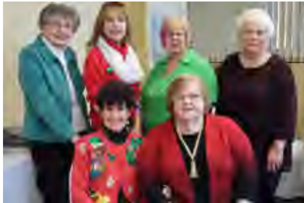
Our 2018 Lodge Officers

Two of our youngest guests had a delightful time visiting with all the other party guests