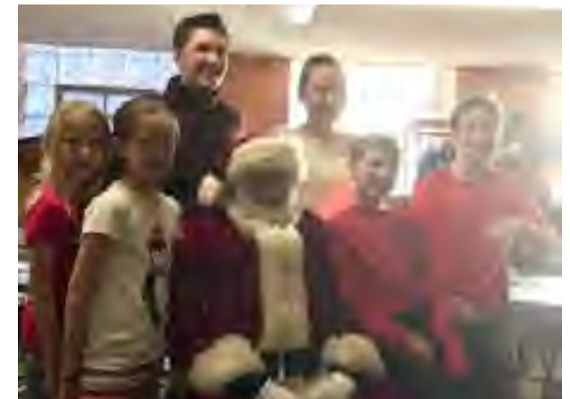
Santa with all the children at our Christmas party.