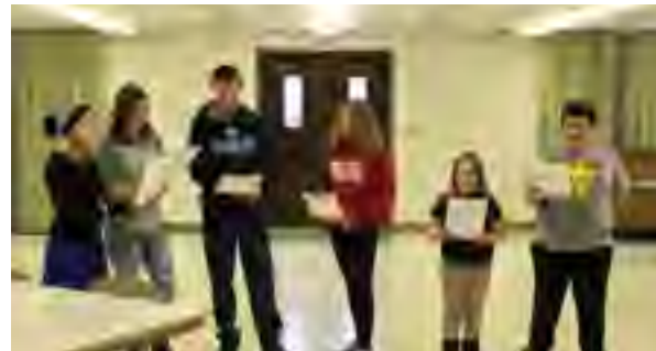
Youth members from #136 take part in some Christmas caroling.