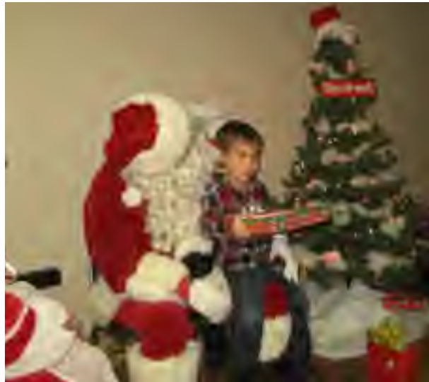
A young member tells Santa what he would like for Christmas

A video from the day can be found on our Facebook page at facebook.com/kskjcleland226 or search for "KSKJ Life Cleveland Lodge #226". We publish event info, share KSKJ Life updates, post pictures and engage with members. Please follow our page!