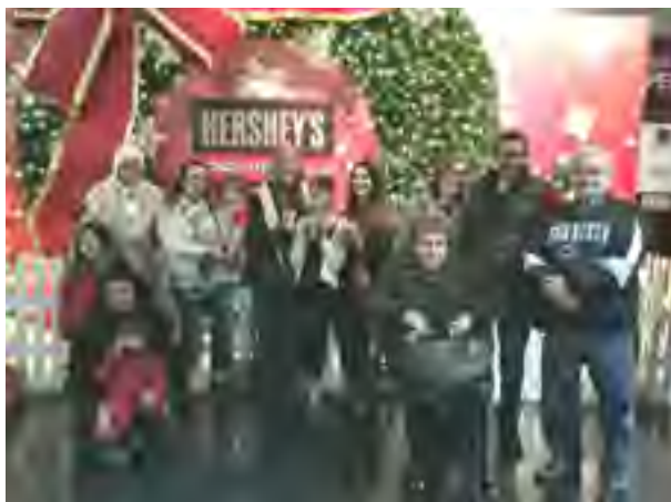
Lodge members enjoying their time at the Christmas party