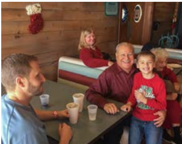
Joliet members are all smiles at the Christmas Party.

With no other news to report about, the next meeting of the combined Joliet Lodges will not be held until February 6, 2018. More information will be available in the next issue of The Voice .