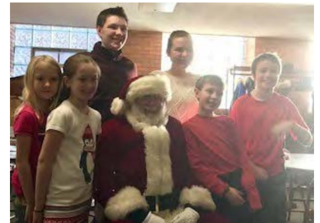
Santa with all the children at our Christmas party.