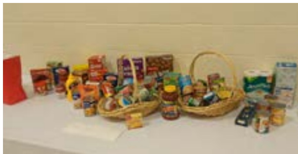
Generous party guests donated items for the St. Mary's Food Pantry as well as the Snacks for Soldiers campaign.

Our first meeting of the new year will be at 6:30 p.m. on Thursday, January 18, at the Collinwood Slovenian Home, 15810 Holmes Ave. If you can't make it, stay up to date by checking our facebook page, St. Joseph KSKJ Life Lodge: 169.