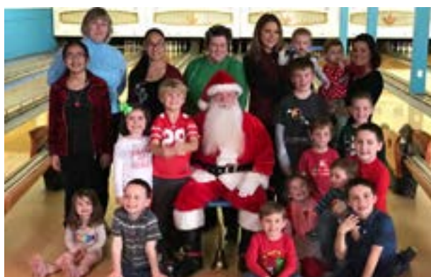
Santa with the children from lodges #63, #146 and #150

Lodges #63, #146 and #150 joined together for their annual Christmas Party on December 3. A great time was had by all and a special guest visited with the children....Santa Claus!