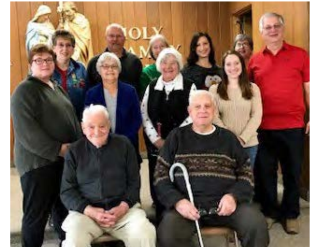
2018 Lodge #59 Officers