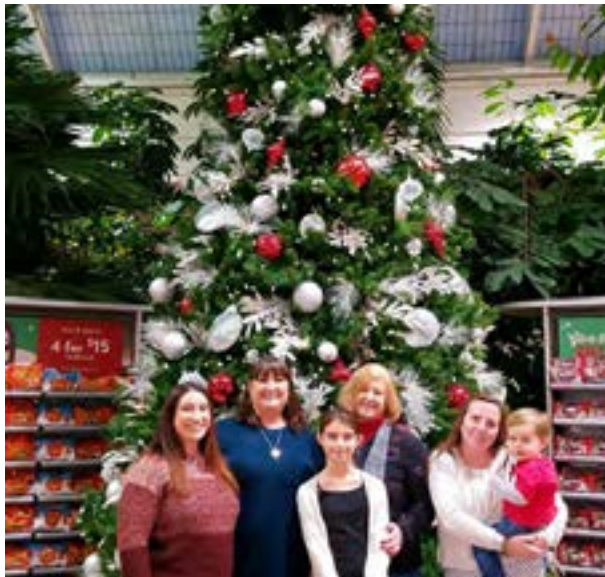
Members of Lodge #42 choose the perfect spot for a holiday photo