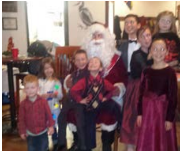
Santa Claus made a visit to the delight of all the children who attended.