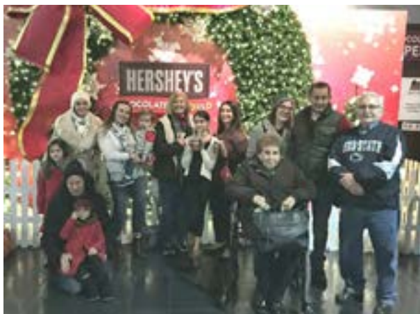
Lodge members enjoying their time at the Christmas party