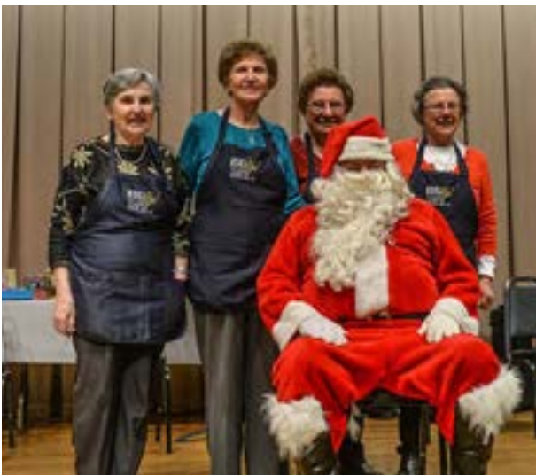
Santa with the kitchen crew.