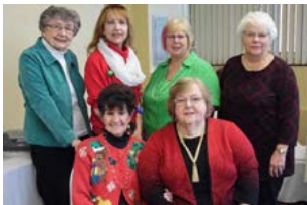
Our 2018 Lodge Officers

Two of our youngest guests had a delightful time visiting with all the other party guests