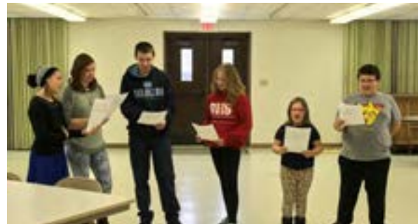
Youth members from #136 take part in some Christmas caroling.