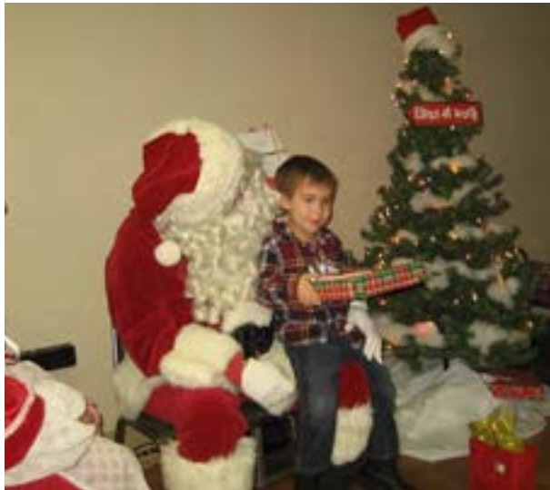
A young member tells Santa what he would like for Christmas

A video from the day can be found on our Facebook page at facebook.com/kskjcleland226 or search for "KSKJ Life Cleveland Lodge #226". We publish event info, share KSKJ Life updates, post pictures and engage with members. Please follow our page!