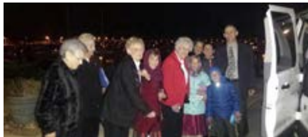
Transportation to and from the party was provided for our guests who no longer drive.