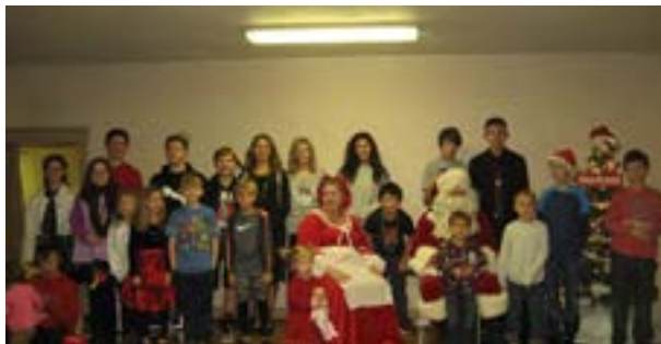
Santa and Mrs. Claus stopped by for a visit to the delight of all the children.