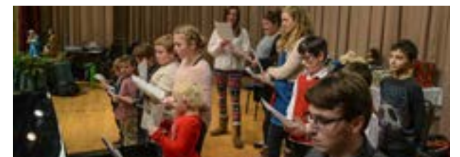
The children entertaining guests with the Christmas carol sing-along.