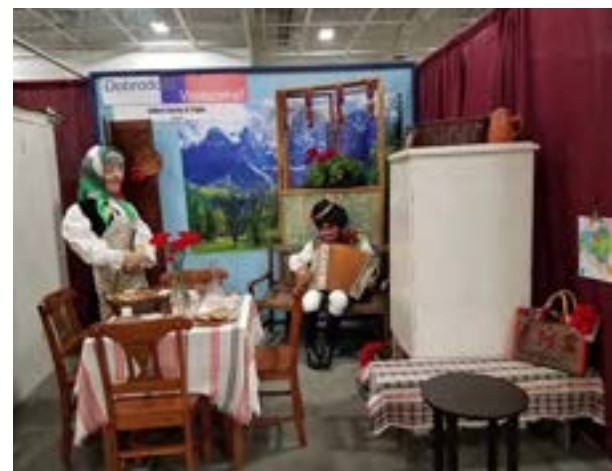
The Slovenian Scene at the Holiday Folk Fair.

The Holiday Folk Fair was held in Milwaukee on November 17, 18 and 19, and the Slovenians were well-represented. This year the cultural display was co-sponsored by the Triglav Cultural Society, USPEH, and the Slovenian Arts Program. The theme was "Welcome." The Slovenian scene was a kitchen displaying Slovenian Foods, a musician and Mt. Triglav pictured through the window. The exhibit took first place in the Artistic Presentation. Many thanks to all the people who helped make our Slovenian Community proud.