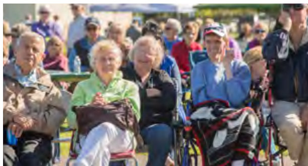
Guests enjoy the music at the "Ethnic Days"