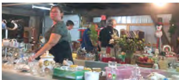
Matching Funds Bazaar Rummage Sale.