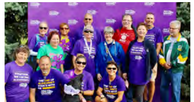
Lodge #2 members at the Alzheimer's Walk

St Joseph Lodge #2 participated in the Will County Walk to End Alzheimer's on October 8 at Rock Run Creek in Joliet. 21 members participated and, so far, we have raised over $2,800—exceeding our goal of $2,000. Donations are being accepted until December 31, 2017. You can donate to our team at http://act.alz.org . Choose "Find a Walk Near You." Click "Find a Team" and enter "KSKJ" to find Lodge #2.