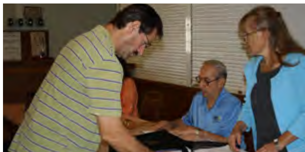
Members sign in for the monthly meeting