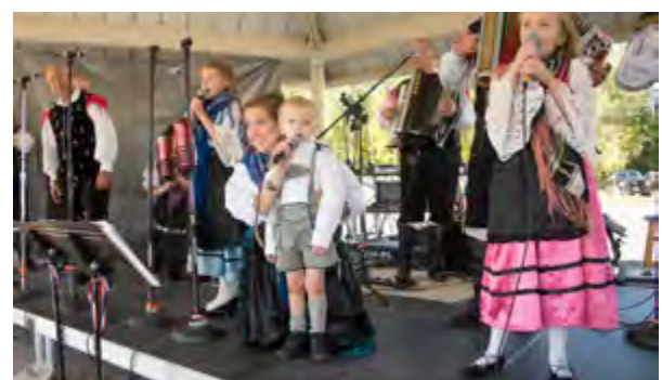
The youngest members of the Singing Slovenes take the stage for a song.