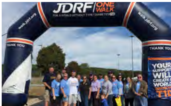
Lodge #29 members at the Matching Funds JDRF Walk