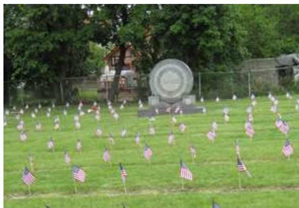
A view of Calvary Cemetery after Lodge #25 volunteers placed flags