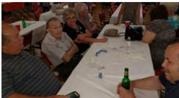
Long time St. Veronica Lodge members having a good time at the 110th Anniversary party!