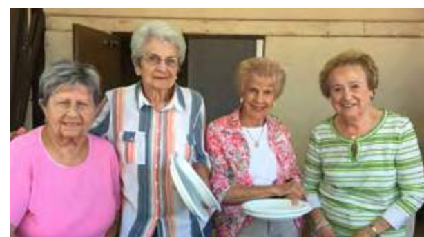
The ladies posing and patiently waiting for their steaks

We just ask and our members always rise to the challenge! There was an overflowing table of school supplies collected for the area's needy children and donated to the Jump On The Bus program at MorningStar Mission. (See photo on page 5.)