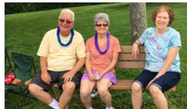
Members enjoying the picnic