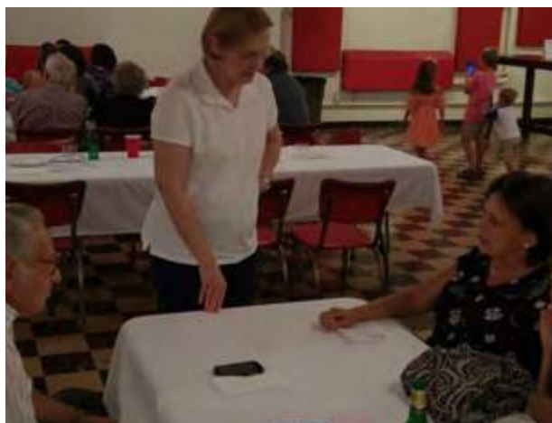
Lodge members and guests discussing the evening's events