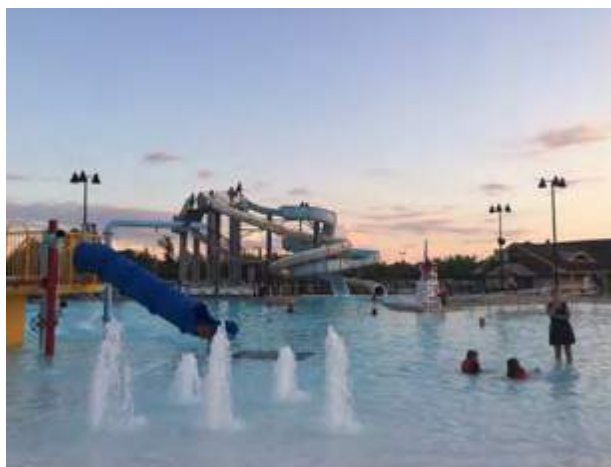
A beautiful evening sky over the water park