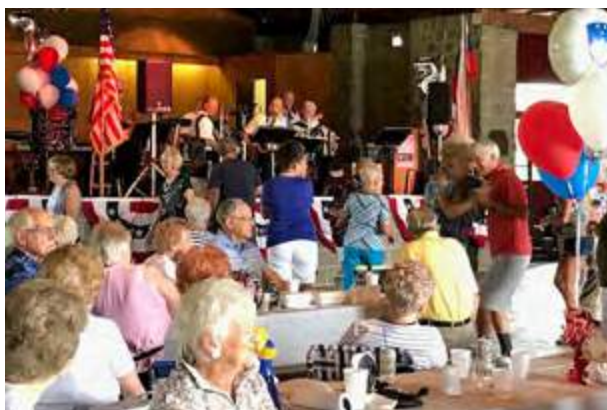
A great time was had by the large crowd that attended the picnic