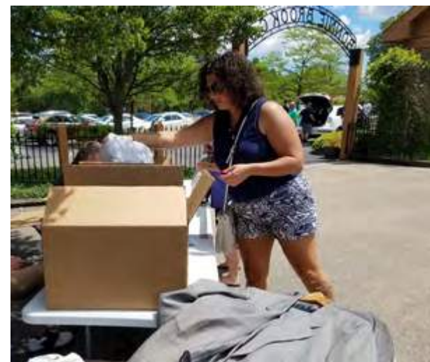
A member makes a clothing donation to the Midwest Veteran's Closet