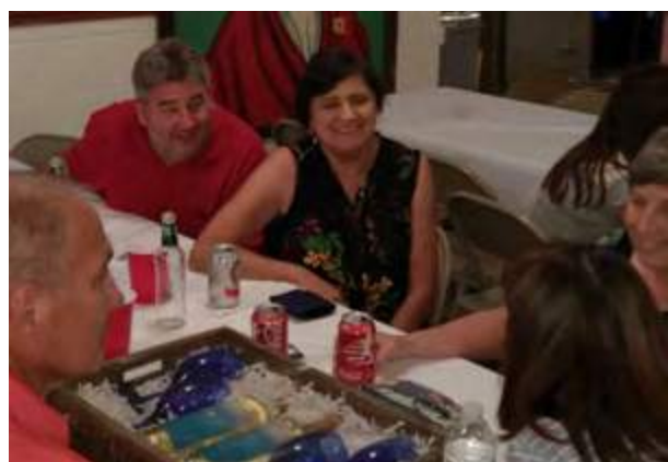
St. Veronica Lodge members and guests' talk over how exciting it is to win a raffle prize.