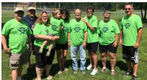
The hard-working Lodge #150 workers