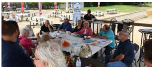
Lodge #44 members enjoying the anniversary celebration

Mark your calendars for this year's Christmas Party, which again will be at the Hammond Marina. Come join us on December 2 for some food and dancing. We will also celebrate our 50-Year Members and Lodge Person of the Year. More information to follow. During our last meeting, we were supposed to have a blessing of the harbor at the Calumet Yacht Club. Unfortunately, this was not able to happen. This has been rescheduled for our next meeting at the club, in April 2018. We were still able to celebrate Lodge #44's 120th Anniversary!