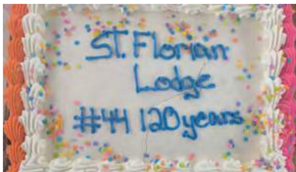
Happy Anniversary Lodge #44!

The casino trip is still in the works for this fall, as well as talks for other great and new events for our lodge. Come and find out what we are talking about at our next meeting on Oct. 1, 2017 at the rectory of Saint George Parish, 9546 S. Ewing Avenue Chicago, IL 60617.