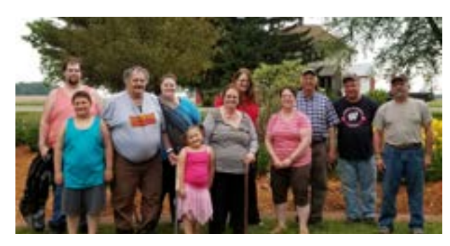
Lodge #136. Additional photos of recent projects starting on page 3.

See page 2 for a list of lodges who have already participated.