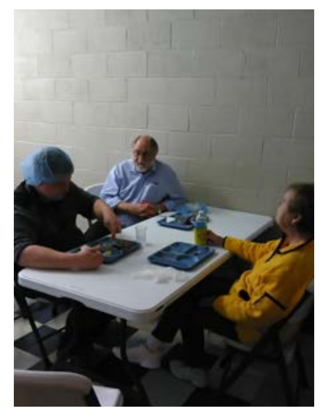
The crew enjoys their own meal after serving at Place of Hope