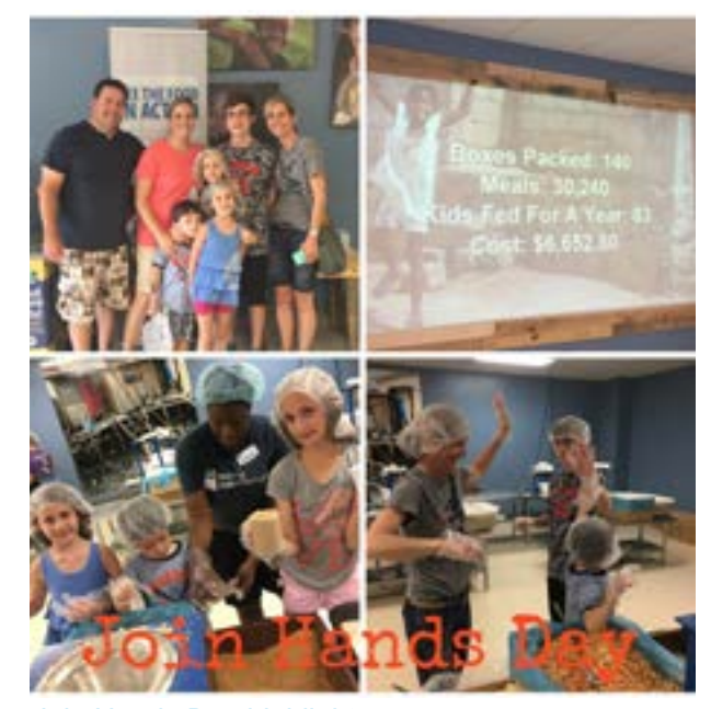
Join Hands Day highlights

their Join Hands Project. Founded in 1987, Feed My Starving Children (FMSC) is a Christian nonprofit that provides nutritionally complete meals specifically formulated for malnourished children. Volunteers hand-pack the meals, which are donated to FMSC food partners around the world.