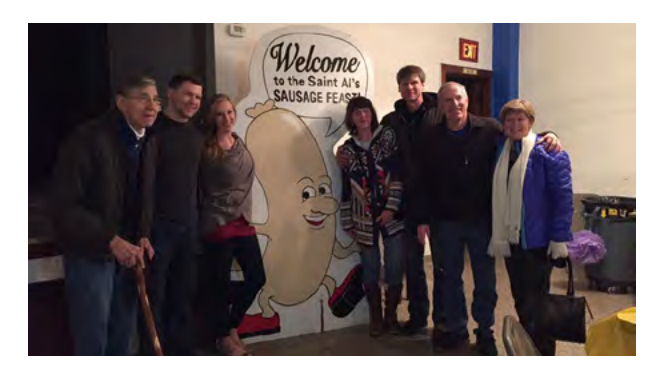
Members of Lodge #52 at the Annual St. Al's Sausage Feast.

St. Aloysius Lodge #52 recently held a Matching Funds Event in conjunction with their Annual Sausage Feast. The beneficiary of the Matching Funds was Pathway to Recovery. Pathway provides transitional and permanent housing to homeless men and women.