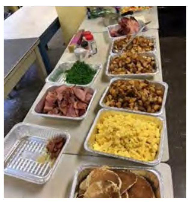
The leftover food that was donated to a local homeless shelter.

Please mark Saturday, July 15 on your calendar for our BBQ. If you are visiting the San Francisco Bay Area, please join us!