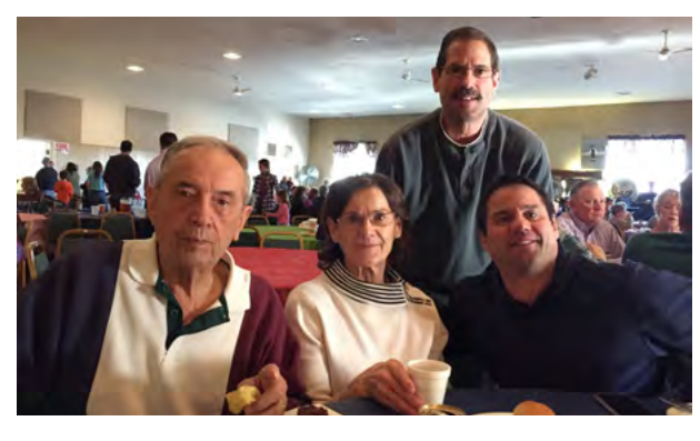
Lodge members enjoying the lodge meeting that was held at the NASH on East 80th.

Have some photos of lodge events? Consider sharing on our Facebook Page (KSKJ Cleveland Lodge #226).