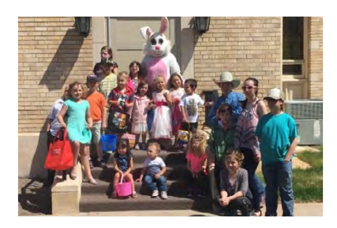
A group picture of the children and the Easter Bunny at the Easter Egg Hunt on April 9.