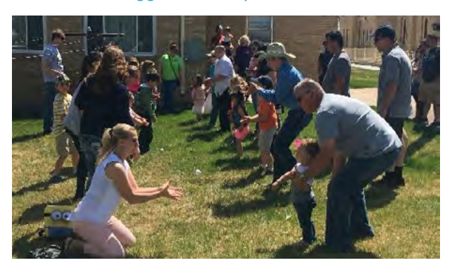
Children participating in the "Egg Toss" activity prior to the hunt

We would like to thank all those who were involved in the preparation/set up for the Palm Sunday Breakfast and the Easter Egg Hunt.