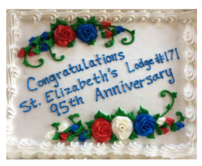
St. Elizabeth's Lodge #171 celebrates its 95th Anniversary