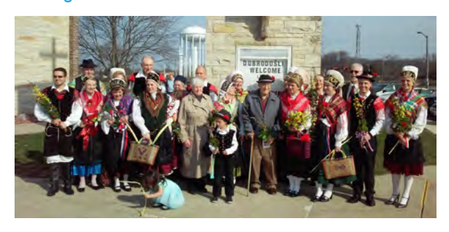
Palm Sunday procession.

We will have our Join Hands Day Project at our regularly scheduled meeting on May 3. Our project this year will be filling Jared Boxes and your help is needed, young and old alike. Jared Boxes will be delivered to chronically ill children at Children's Hospital. We are centering on children between the ages of 2-4 and 4-8. We are in need of things like coloring books, crayons, balls, paint sets, soft animal toys, cars, etc. Won't you help us? Please bring them to our meeting on May 3, at St. John's Rectory Meeting Room at 6:30 p.m. Please enter on the north side of the building.