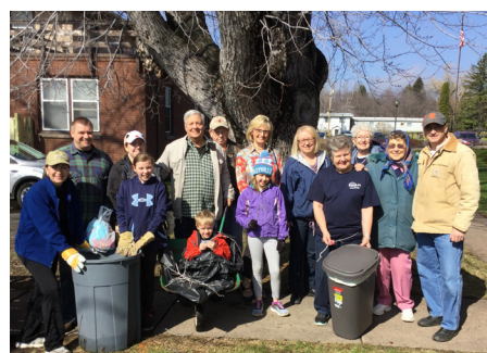
St. Elizabeth Lodge #171 Duluth, MN