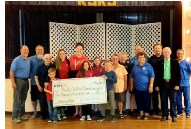
Members of KSKJ at the check presentation for the Matching Funds with members of the Pueblo Children's Chorale.