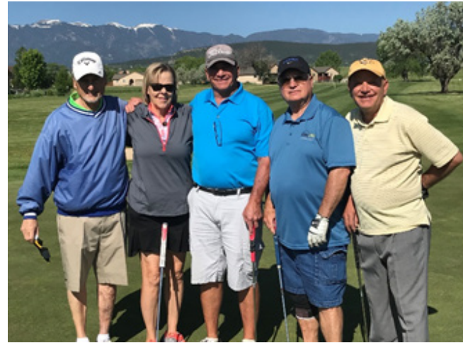
Pictured above is the first-place team at the annual golf tournament.

Make sure to tell your kids and your grandkids that St. Joseph's Lodge #7 scholarship applications will be DUE September 30, 2019. Students must be a member of Lodge #7 and be enrolled in a parochial high school or an institution of higher learning. Students must send a letter requesting the college or high school scholarship. Be sure to INCLUDE in your letter how many Lodge #7 events you attended the previous year and information about support you and your family/household provided to KSKJ Lodge #7 the previous year. Along with the letter, students must send a copy of their upcoming class schedule and a copy of their transcript. If a member is requesting a scholarship for a second, third or fourth year, they must complete at least 5 hours of service to Lodge #7. These hours need to be verified in writing by a KSKJ Lodge #7 officer and sent alongside the other required documents in order for the application to be considered.