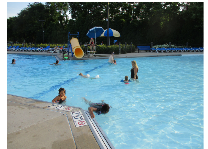
Everyone, but especially the kids, had a great time playing around in the pool!