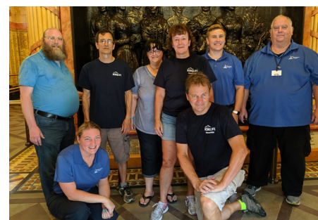
St. Joseph Lodge #169 Cleveland, OH