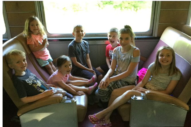
Youth Members bonding on the Pizza Train.

St. Elizabeth Lodge #171 also held a Pizza Train ride this summer, which was a part of our ongoing 125th Anniversary Celebration. A great time was had by all.