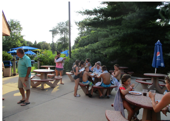
KSKJ Life members enjoying a nice pizza break.