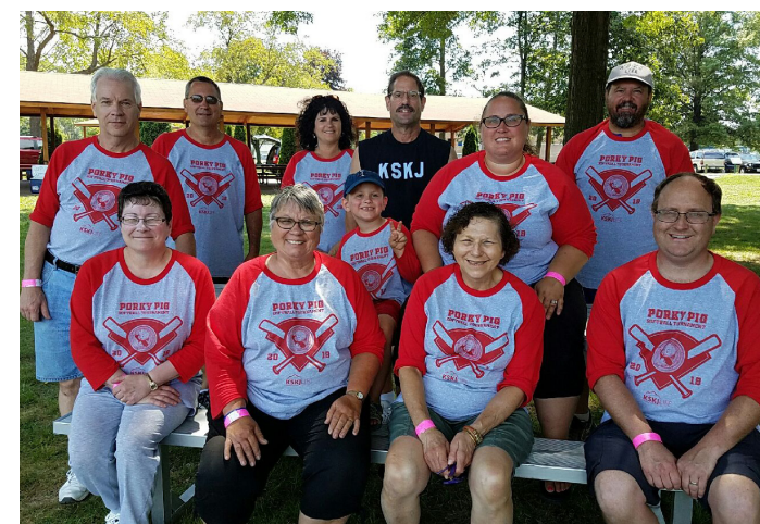
Lodge #150 Members Crew