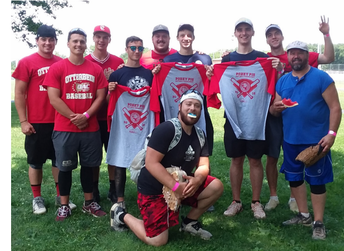
2019 Porky Pig Championship Team Snyder - Blue!