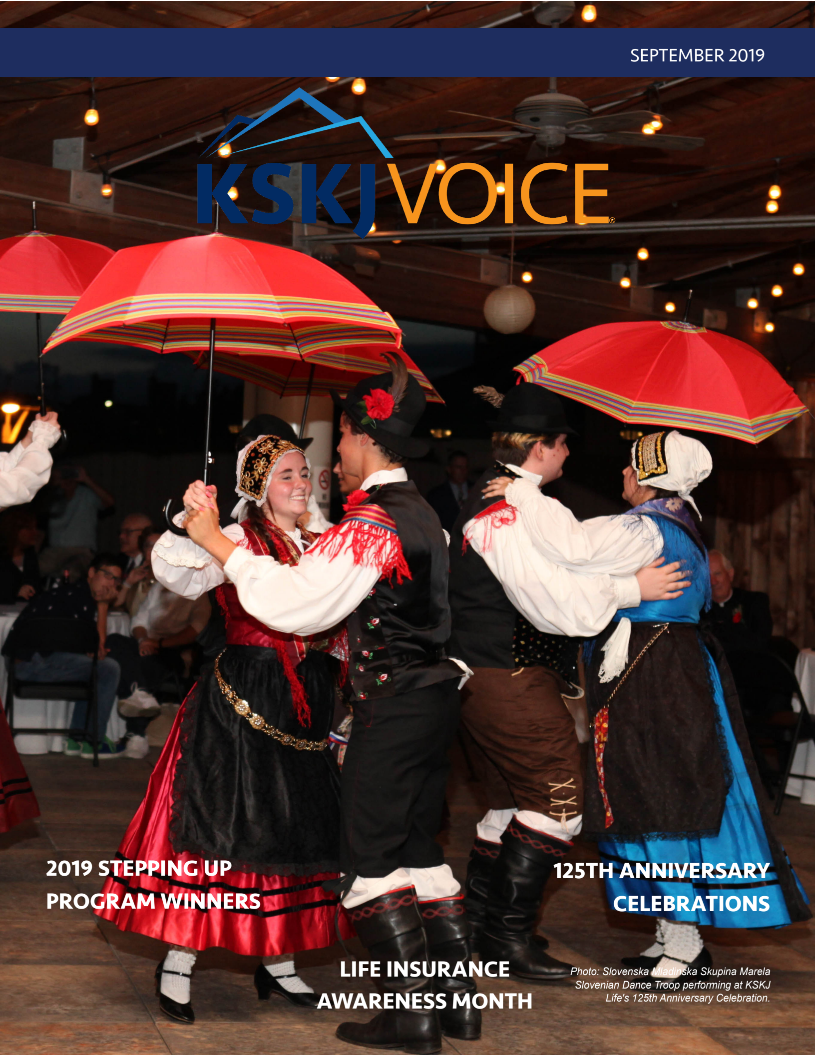
Photo: Slovenska Mladinska Skupina Marela Slovenian Dance Troop performing at KSKJ Life's 125th Anniversary Celebration.