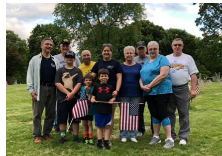
Blessed Virgin Lodge #50 Pittsburgh, PA

Each Spring, KSKJ Life members across the nation "join hands" to make a difference in their communities through helpful projects that connect youths and adults. Congratulations to the winners selected in the Join Hands photo contest drawing! Each winner will receive $125 for the charity of their choice. Thank you to everyone who shared their Join Hands projects to help your community!