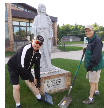
Blessed Virgin of Help Lodge #196 Gilbert, MN