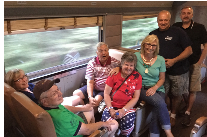
Adult Members bonding on the Pizza Train.