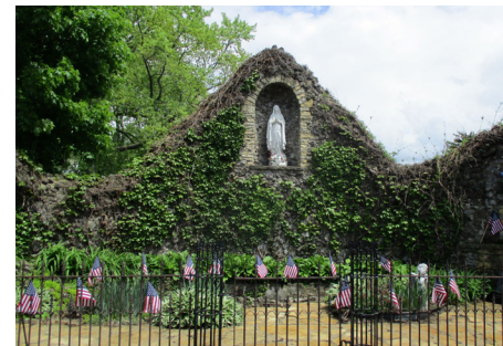
St. Genevieve Lodge #108 Joliet, IL