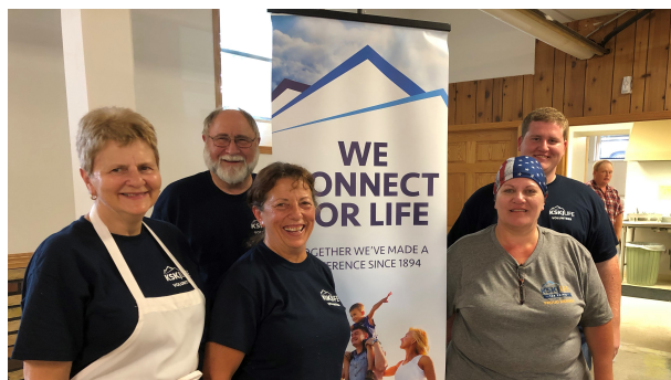
Lodge #197's Matching Funds Breakfast event was a delicious success