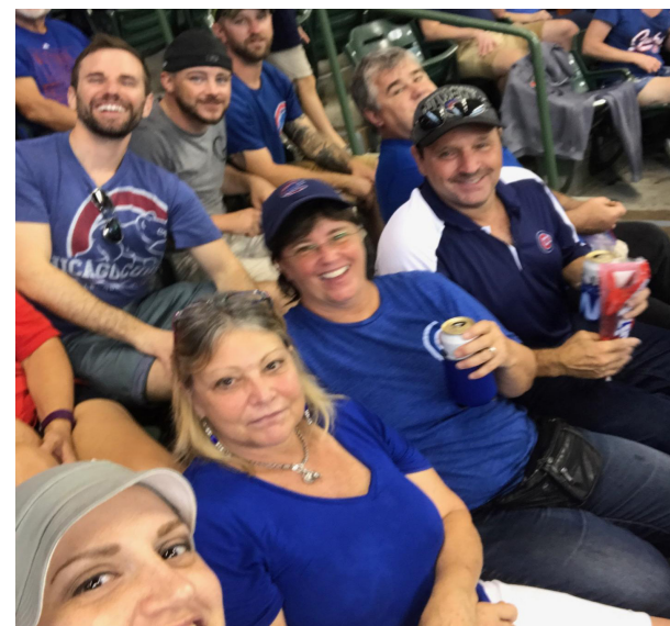
Lodge 44 members and guests had a ball attending the annual baseball outing

This year's baseball outing was a bus trip to see the Chicago Cubs take on the Milwaukee Brewers. Unfortunately, most members went home disappointed with the Brewers coming in clutch for the win, although neither the weather or score prevented everyone who came out from having a good time.