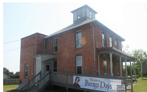
The Bishop Baraga Educational Center opens its doors for the first time.