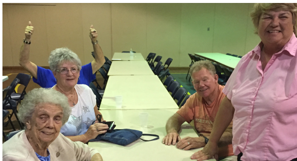
The card playing gang enjoying time together during the annual lodge Steak Fry