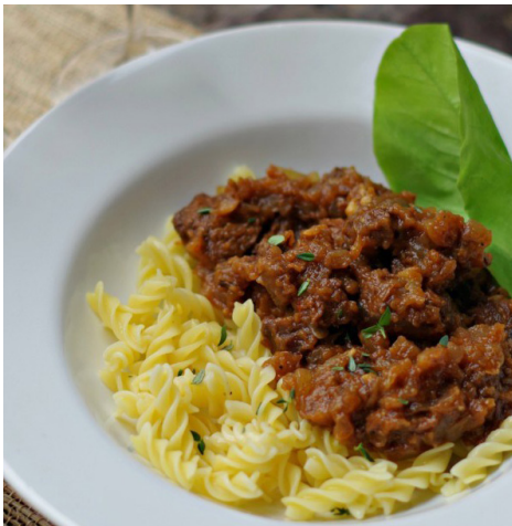
Plate of Solvenian Goulash

Brown stew meat in oil. Add chopped onions and cook until browned. Add remaining ingredients. Add water to cover meat and to keep ingredients from scorching. Simmer for 2 to 3 hours, until meat is fork tender.