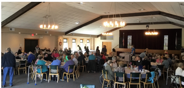
Lodge 1 & Lodge 170 Matching Funds dinner drew quite the crowd on September 9, 2018.