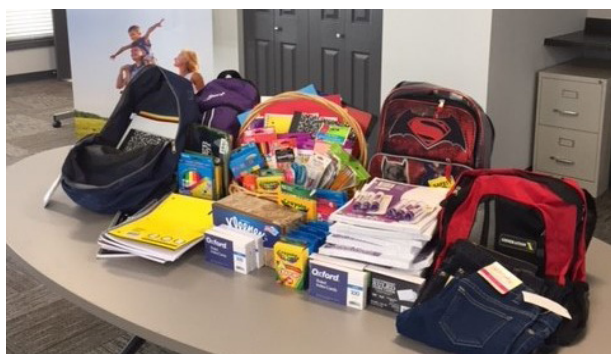
School supplies were collected for Morning Star Mission at the annual Splash Station event this summer.

The Joliet KSKJ Life Lodges held their annual Splash Station event on Saturday, July 22nd! They collected school supplies for Morning Star Mission's "Jump on the Bus Program." Each fall, this program helps provide more than 325 children with all the school supplies they need, from pencils to tennis shoes. Thank you to all those who donated!