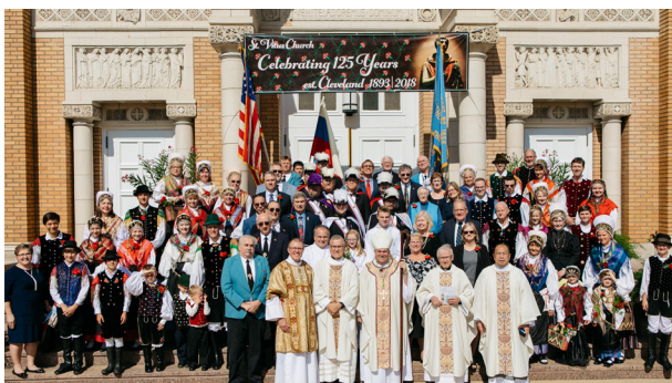
St. Vitus Church celebrates the 125th year anniversary of their founding.