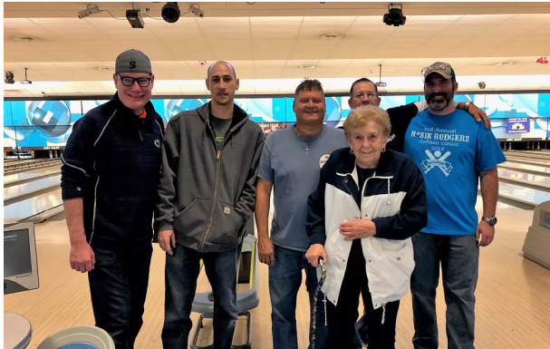
Members of Lodge #42 enjoyed themselves bowling on October 13th

of officers will be held at the lodge meeting on December 18, 2018 at 6:00 p.m..