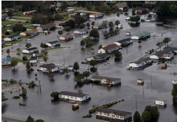
Flooding from Hurricane Florence as seen in Lumberton, North Carolina.