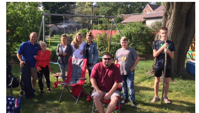
Members outside enjoying the beautiful weather.

Some of our younger guests (along with a few “kids at heart”) channeled their inner Picassos and colored some Christmas coloring pages that will be distributed to residents of Our Lady of Angels Nursing Home in Joliet when our lodge goes caroling there in December. More information about this caroling event will be forthcoming.