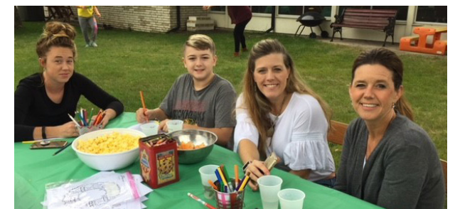
Members enjoyed coloring Christmas pictures for residents of Our Lady of Angels Nursing Home in Joliet. The pictures will be distributed in December during our holiday caroling event there.

Some of our younger guests (along with a few “kids at heart”) channeled their inner Picassos and colored some Christmas coloring pages that will be distributed to residents of Our Lady of Angels Nursing Home in Joliet when our lodge goes caroling there in December. More information about this caroling event will be forthcoming.