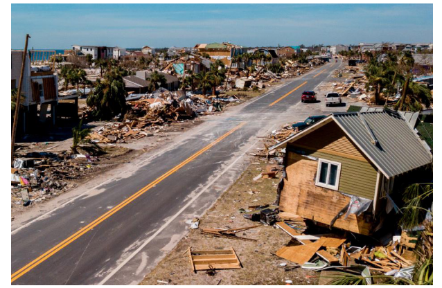
Mexico Beach, FL after Hurricane Michael