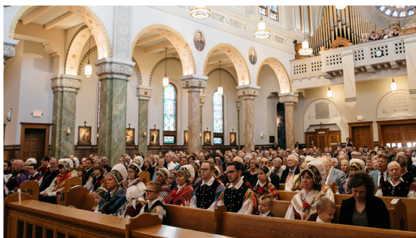
650 + congregants attended mass on the 125th anniversary date of St. Vitus church.