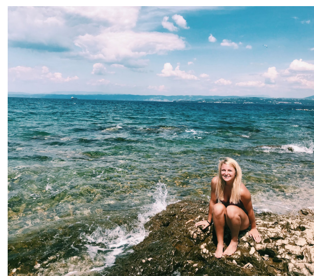
Beach days are the best days! The bodies of water in Slovenia were incredibly clear and blue.

"The charm of Slovenia and the people in it are things I will always look back fondly on," Lacey reminisced. "If I ever found out that I only had one more day to live, I would want to go back and spend it there."