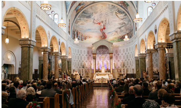
An inside view of St. Vitus Church.

Neuzil was called forward to offer an opening prayer for the banquet.