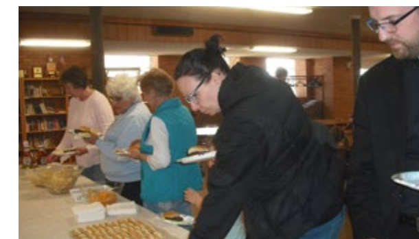
Guests fill their plates with some delicious home-made sweets as well as the perfectly-cooked burgers.

On May 5th, our lodge helped with the Cinco de Mayo celebration/fundraiser for Marquette School at Holy Spirit Church in Virginia. Earlier that same day we helped the Eveleth Fire Department with a BBQ sale during the Eveleth City Wide Rummage Sales.