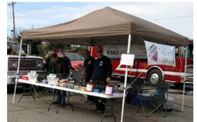
The Fire Department crew with members of KSKJ Life ready to open the BBQ tent