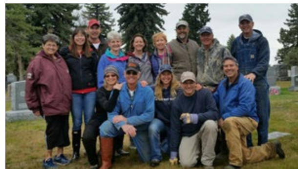
Members and officers of Lodge 69 participating in Join Hands Day.

St. Joseph Lodge #69 cleaned the gravesites of 24 deceased members, as well as an additional 30 gravesites of relatives and friends, as their main Join Hands Day Project on May 12th. After completing this project, the group gathered for a well-deserved brunch! Prior to this project, lodge members also cleaned 4 miles of road ditches leading into the community of Belt, MT.