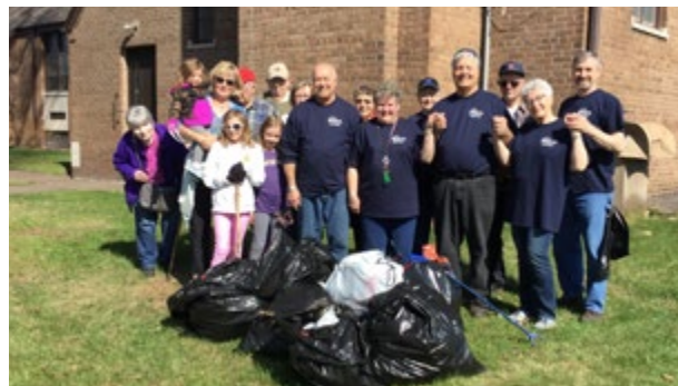
A team effort for Join Hands Day