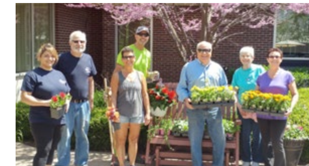
Members of Lodge 2 are all smiles as they get ready to plant some flowers at Sunny Hill Nursing Home

St. Joseph Society KSKJ Life Lodge #2 participated in Join Hands Day on May 7, 2018 at Sunny Hill Nursing Home. We had eight lodge members help plant flowers on the grounds on a beautiful spring day. It turned out looking great.