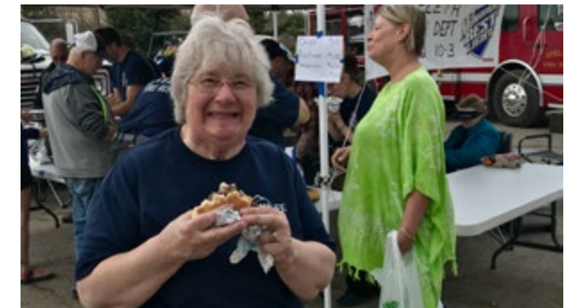
Yum! That's delicious BBQ!