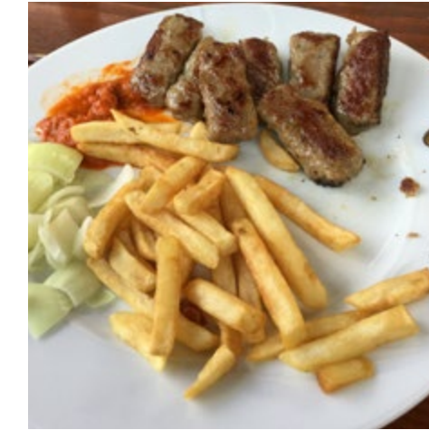
Plate of traditional Čevapčiči from an outdoor restaurant in Slovenia.