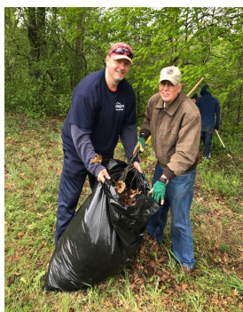
Lodge #1 & #29