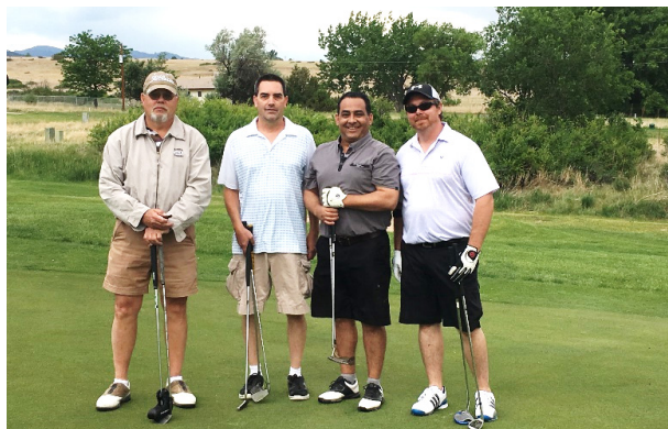
The second-place team at the annual golf tournament.