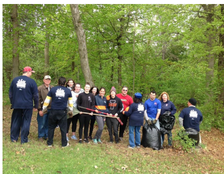
Lodge #1 & #29