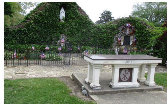
The Grotto area at St. Joseph Cemetery after all the flags were placed and the Poppy Wreath was put up.

Moving along, on Sunday, June 10th, a mass was said to honor all living and deceased members of St. Genevieve Lodge #108. After the 11:30 am mass, a social gathering was held in Ferdinand Hall. Sandwiches, chips, soda, water and coffee were served.