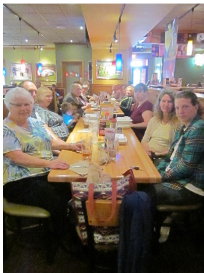
Members celebrating with a wonderful meal at the Lodge #219 awards luncheon.

Officers. Each received certificates and a gift from the home office.