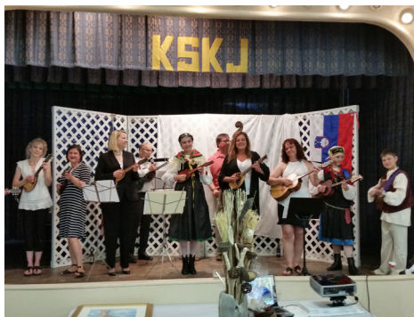
The Pueblo Tamburitzans entertaining at the fundraiser.

The Paper Cup International Tennis Tournament is held each year in Pueblo on Memorial Day weekend. Over the past 39-year history, it has featured some exceptional players from Slovenia, Mexico, Italy, Sicily, China, Russia, Latin America and various other countries.