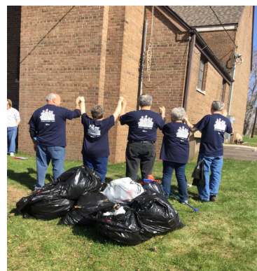
Lodge #171 shows us how they "join hands"

people, but of course it does not need to be limited to one day of the year. When Hurricane Harvey hit in Houston last year, we saw an unbelievably generous response from our members, who were eager to do anything they could to help those who had lost so much.