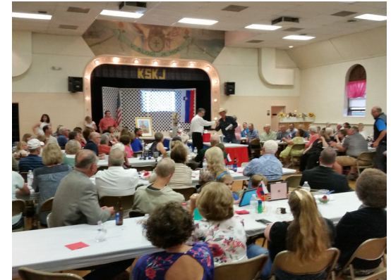
A Fundraiser Dinner held at St. Joseph KSKJ Hall, honoring the Slovenian Tennis players sponsored by the Pueblo Sister Cities Commission.