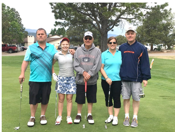
The first-place team at the annual golf tournament.