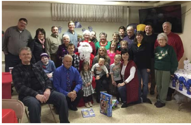
KSKJ Members gather for a group photo at Lodge 171's recent Christmas Party