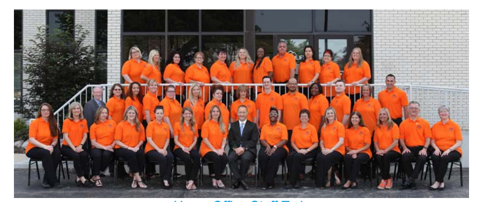
Home Office Staff Today