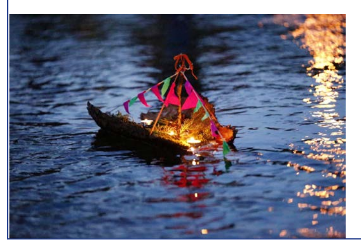
A lit house boat floating down Tržič Bistrica during Gregorjevo.

Ever wondered how other countries celebrate Valentine's Day? Unlike other countries, Valentine's Day celebration in Slovenia is not about romance and candy hearts. Celebrated on March 12th, which according to the old calendar was the first day of spring, Gregorjevo is the Slovenian lovers' day—the equivalent of St. Valentine's Day. There's a romantic saying that Gregorjevo is the day "when birds get married". Old legend says that on St. Gregory's day, the first bird (a symbol of love) that a girl will see in the sky will tell her who she will marry someday. There's even a special tradition in the Tržič town where children and adults make Gregory's lights and little houses on rafts which they, later on, put into the river for the flow to carry. This ritual comes from the times long ago when cobblers and tailors used to work house by house. With the beginning of the spring, they stopped using candles and were able to work by daylight. To celebrate it they used to clean their workshops and place all the shreds into the small baskets. Then they lit those baskets and put them into the stream Tržič Bistrica. So today, little houses came into the place of baskets, but still this ritual symbolizes throwing the light away and welcoming the spring. Nowadays, people put all kinds of boats in the river, making it quite a lovely sight to to watch all the craftwork floating in the water. [rove.me]