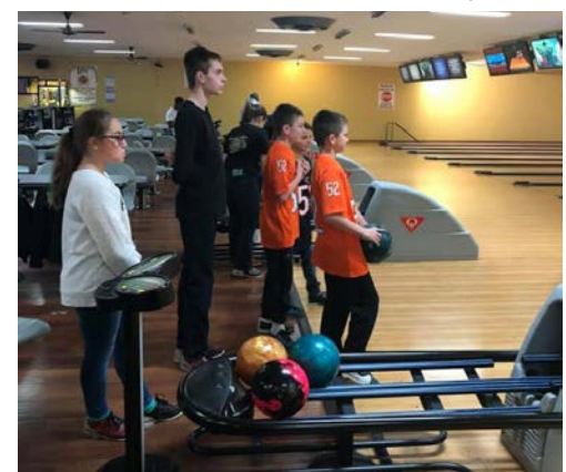
Youth members anxiously await the outcome of their teammate's throw. Could it be a strike?!