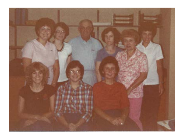
Home Office Staff 1983