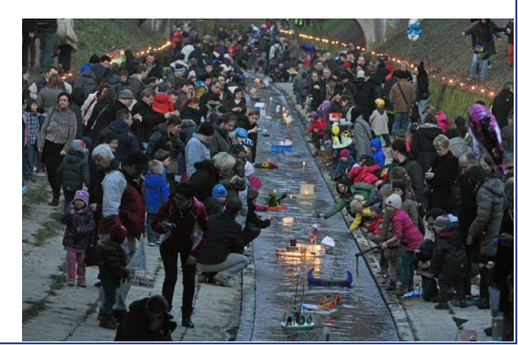
A crowd gathers on Gregorievo to float their boats down the river.