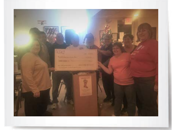
Lodges 63, 146, 150