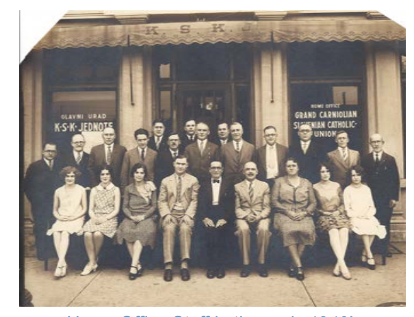
Home Office Staff in the early 1940's