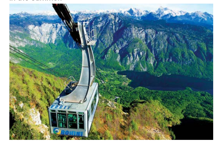
A cable car going up Mount Vogel.

"In my opinion, summer is the ideal time to take a trip to Slovenia," said Frank. "There's so many festivals and concerts and everything is in bloom. A lot of people don't know this, but there actually are palm trees in Slovenia!" Palm trees can in fact be seen close to the Adriatic Sea and in the Alps. The climate in Slovenia is considered continental, with cold winters and warm summers, but at the coastal areas there is pleasant submediterranean climate. The Slovenian coast isn't well known for its beaches, but one coastal town called Portorož has its very own man-made beach — a must-see for beach goers in the summer.