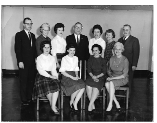
Home Office Staff in the mid 1960's