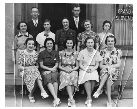
Home Office Staff 1937

AS PART OF OUR 125TH ANNIVERSARY YEAR CELEBRATIONS, WE'RE TAKING A LOOK BACK ON THE HISTORY OF KSKJ LIFE THROUGHOUT THE YEARS. LOOK HOW THE HOME OFFICE STAFF HAS GROWN!