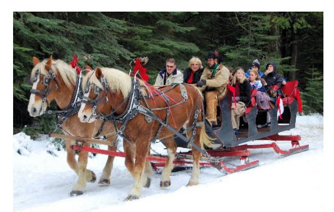
Join Lodge 171 members for the annual Sleigh Ride on Feb 17th!