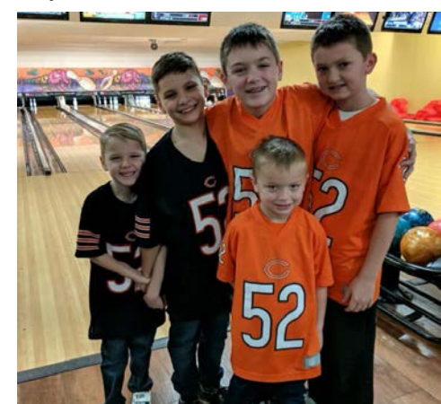
The bowling alley was filled with Bears fans that afternoon, as evidenced by this group of youth members.

took place after lunch which included the Installation of the 2019 Lodge Officers and an acknowledgement to our 50-year members.