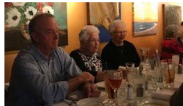
Christmas party guests enjoying their time with friends