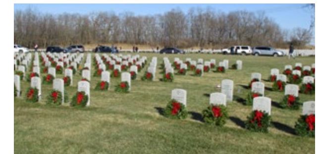
Photo of holiday wreaths that were laid at veterans' headstones.