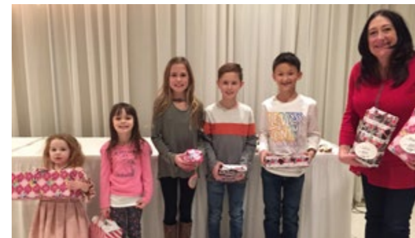
Santa said the kids of Lodge #29 were extra good this year!