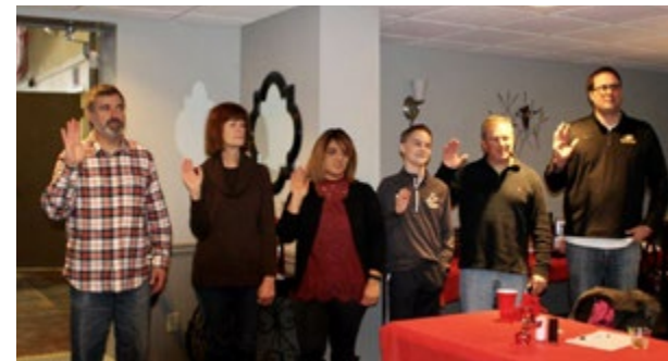
The swearing in of the 2018 officers