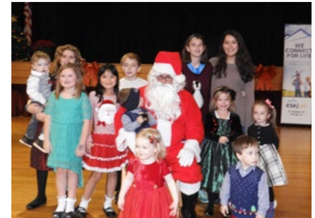
It was all smiles when the man in red made an appearance at the party.