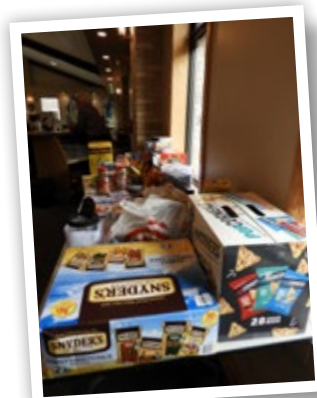
Lodges #1 & #170