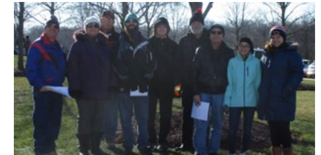
Officers from St. Genevieve Lodge #108 and members from Joliet Rivals Club.

National Cemetery. The weather had finally cooperated for us so that we could honor our fallen soldiers by placing holiday wreaths down on the gravesites. As long as I am able, I will continue to help out with the "Wreaths Across America" program. There are times that it just takes your breath away after seeing all the holiday wreaths down.