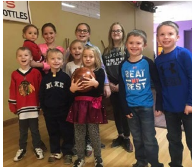
It was all fun and smiles at the Christmas Bowling Party for our youth attendees.

Crest Hill, IL. Guests enjoyed bowling, pizza and plenty of camaraderie. More pictures from the event can be found on our Facebook page.