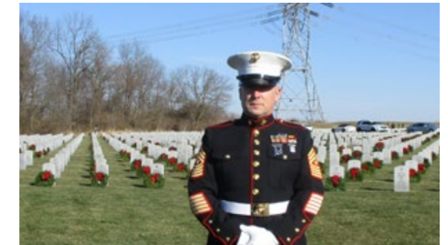
Photo of a marine (name unknown) standing in front of a field of headstones adorned with holiday wreaths.