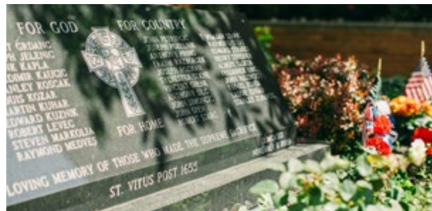
St Vitus Courtyard with Veteran "Memorial Stone" installed and dedicated in 2009 listing the names of 42 veterans from the parish that were killed in action, WWII to Vietnam Wars.

Both Post 1655 and PLAV Post 30 now have a number of the members that are much older than when they joined. But the workload to help disabled veterans, veterans in need of medical care, visitations to the VA Hospital, however, continues to increase.