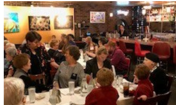
It was a full house for the Lodge #104 Christmas party