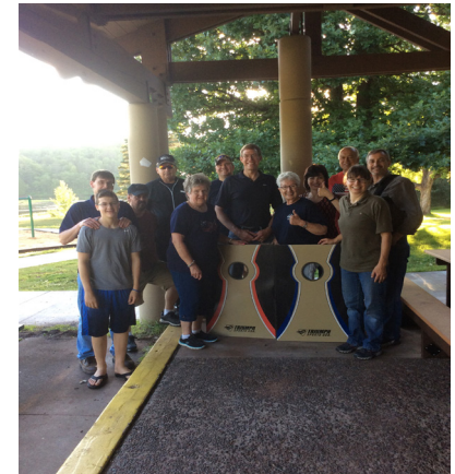
Members enjoyed the recent Polka Party Picnic and Beanbag Tournament, which was held in Chambers Grove in the Fond du Lac neighborhood of Duluth, MN.