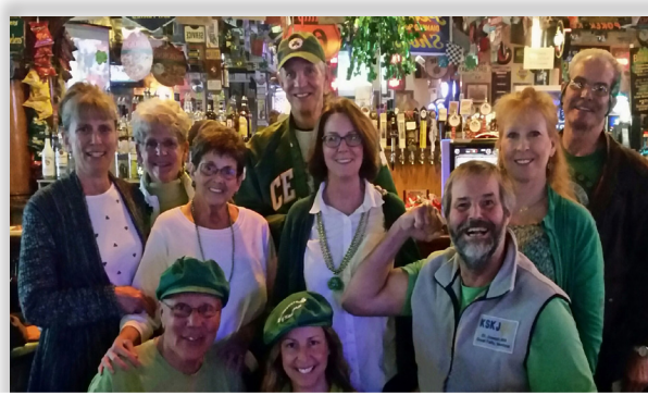
St. Joseph Lodge #69 from Great Falls, MT during their St. Patrick's Day Lodge meeting in 2018

Congratulations to Lodge #69! Here's to many more terrific years to come!