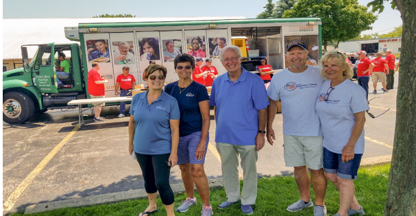
Three officers from St. Mary #79 participated in a Food Distribution Day at the Midwest Veterans Closet, sponsored by Com Ed.