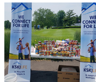
KSKJ Life members & friends participating in this year's National Golf Tournament show their generous nature by bringing "meals in a can" for the Midwest Veterans Closet.